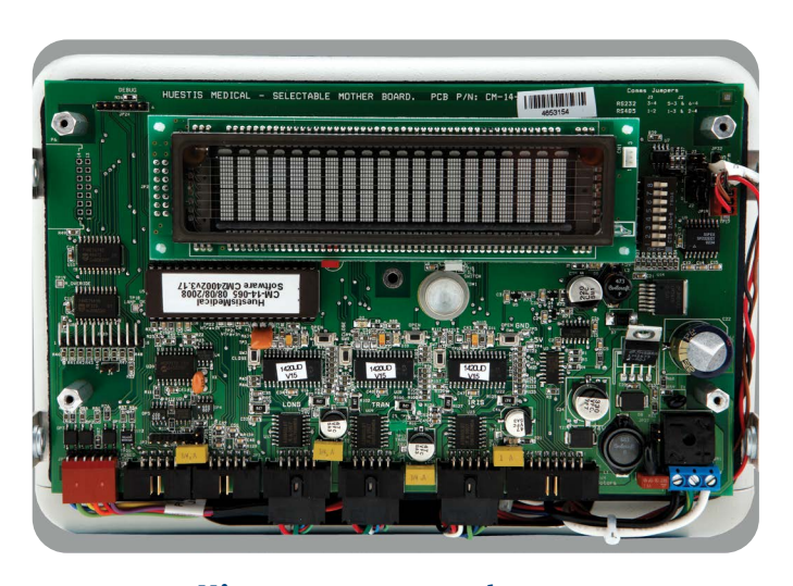
Microprocessor control system