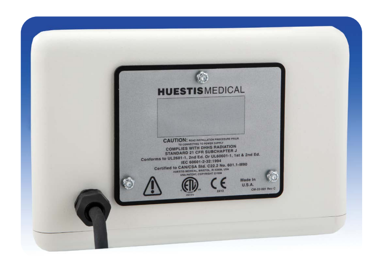
Easy access lamp replacement

Our CM-4201 Series is equipped for serial control (from custom software provided by customer) in a choice of RS232, RS485, or CANBUS protocols. The rotary input interface allows on-the-fly field size adjustments by the technician.