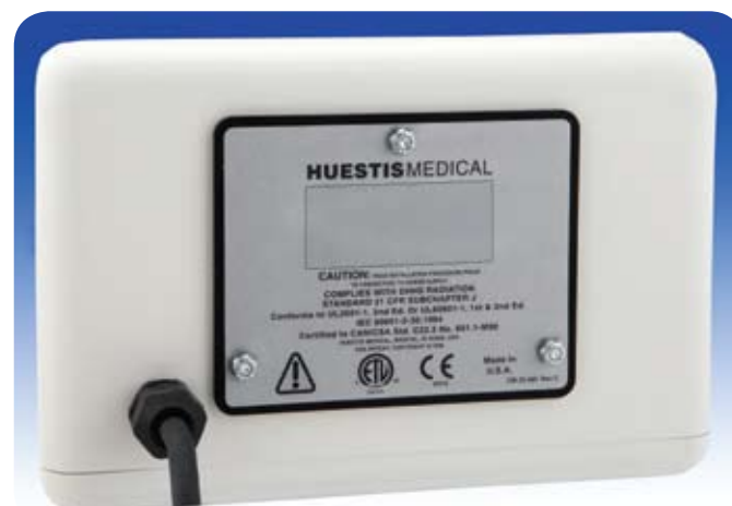
Easy access lamp replacement

Our CM-4201 Series is equipped for serial control (from custom software provided by customer) in a choice of RS232, RS485, or CANBUS protocols. The rotary input interface allows on-the-fly field size adjustments by the technician.