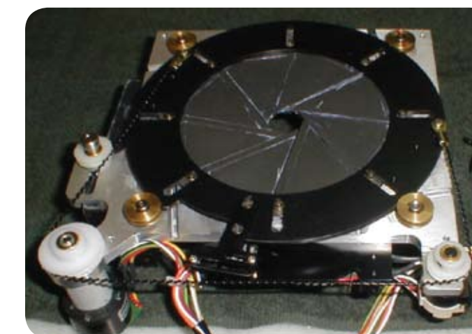
IRIS shutter assembly

Special order remotely controlled under-table models are also available to complement a wide range of applications tailored to your radiographic needs.