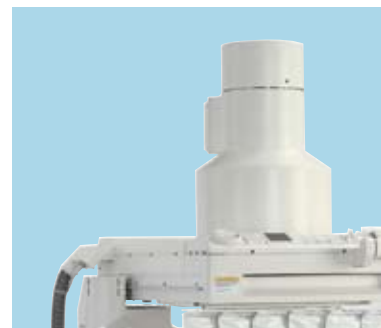
88/35 Spotfilm Device

All Huestis Medical remanufactured systems are guaranteed to deliver performance and safety features that meet or exceed original manufacturer's specifications – at about half the price of new.