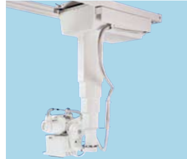
GE XT Suspension