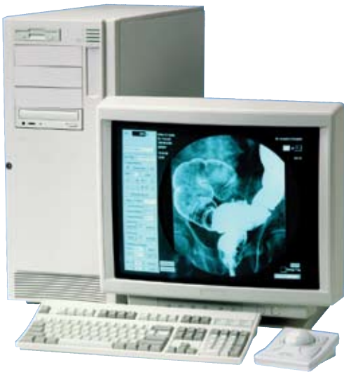
Digital Imaging – At Your Fingertips

R/F and Rad Units Come with a Standard 2-year Warranty