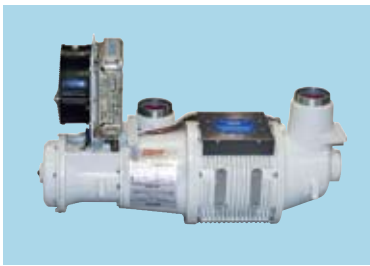
NEW Dunlee Tube